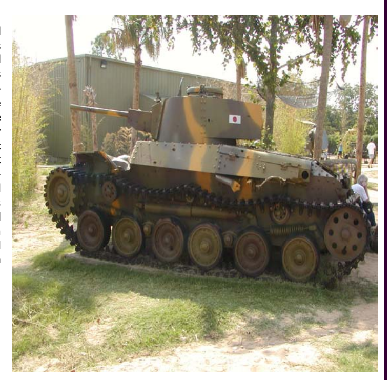
Japanese Shinhoto Chi-Ha medium tank at The National Museum of the Pacific War, Fredericksburg, Texas.