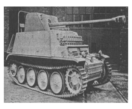
A factory fresh Marder II (Sd.Kfz.132)

In our next issue I will go into some Marder II (Sd.Kfz 132) in Russia detail about each Marder SPG.