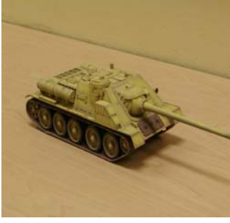
Terri Lowman's DML SU100