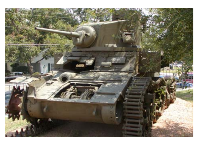
Australian M3 Stuart at the National Museum of Pacific War in Fredericksburg, Texas.