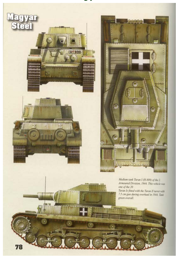
Here is a sample of the color plates in Magyar Steel : A Turán I medium tank with a Turán II turret with 7.5cm gun.

"ONE OF MY FAVORITE PHOTOS OF THE BOOK (PAGE 7) IS OF A CAPTURED RUSSIAN M3 STUART LIGHT TANK TOWING A HUNGARIAN T-38 (PZ.KPFW 38(T)). THE M3 STUART WAS CAPTURED BY THE HUNGARIANS AND PRESSED INTO SERVICE AS A DIVISIONAL