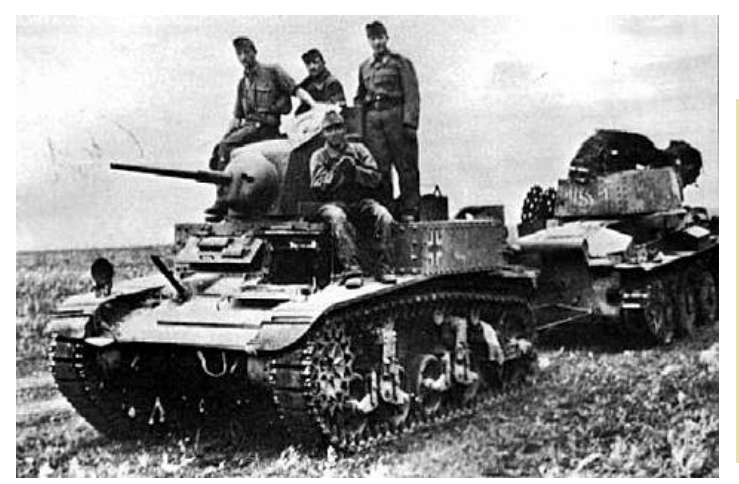
A captured Russian M3 Stuart towing a disabled Hungarian T-38 (Pz.Kpfw 38(t)).

One note about the author's attention to accuracy, a correction to the First attack at Korotoyak is included in the