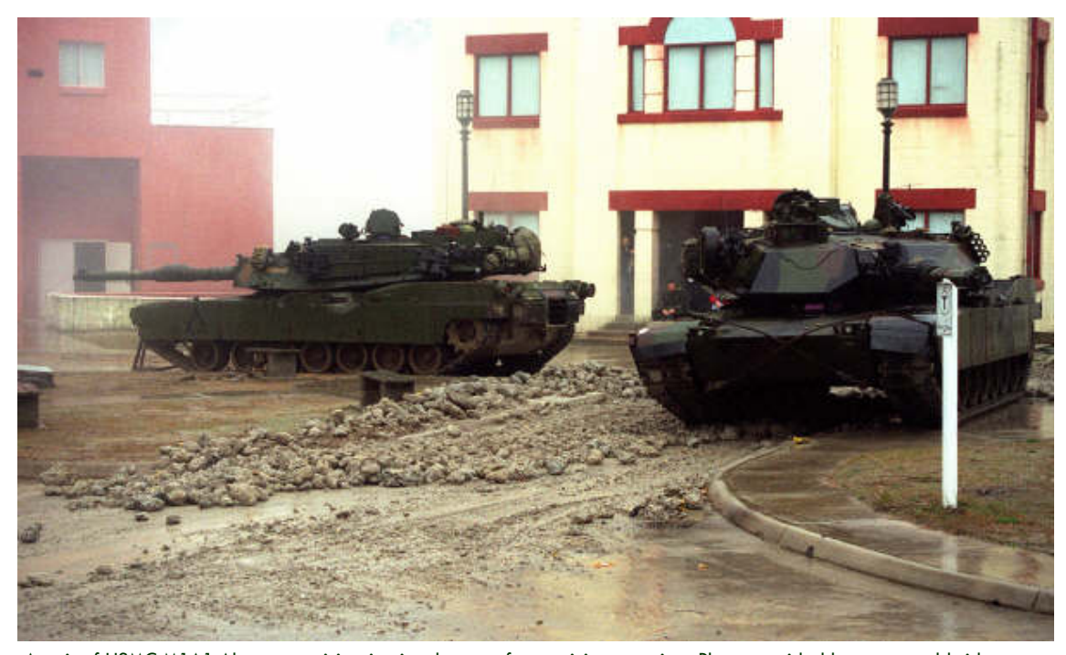
A pair of USMC M1A1 Abrams participating in urban warfare training exercise.