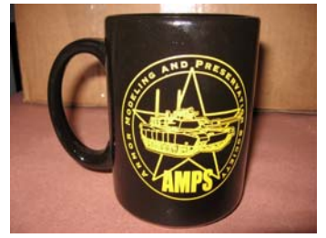
Here is the front of the AMPS Mug. It has the AMPS logo on the front and the web address on the back.

If you sign up for an AMPS membership you will get to select a cap or mug for free.