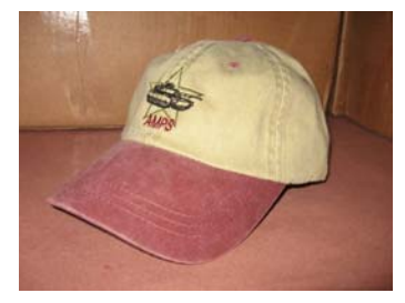
Here is a front side shot of the AMPS Cap. Looks nice.