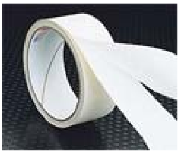
Another example of double sided sticky tape.

If you have to create multiple copies of the same part, make a stack of plastic sheet held together with the tape. Pieces can be temporarily held together while drilling matching holes.