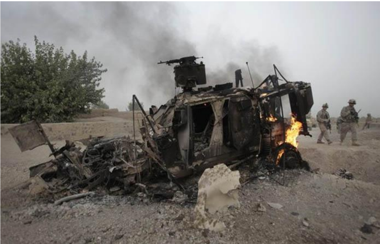
A destroyed M-ATV in Afghanistan.