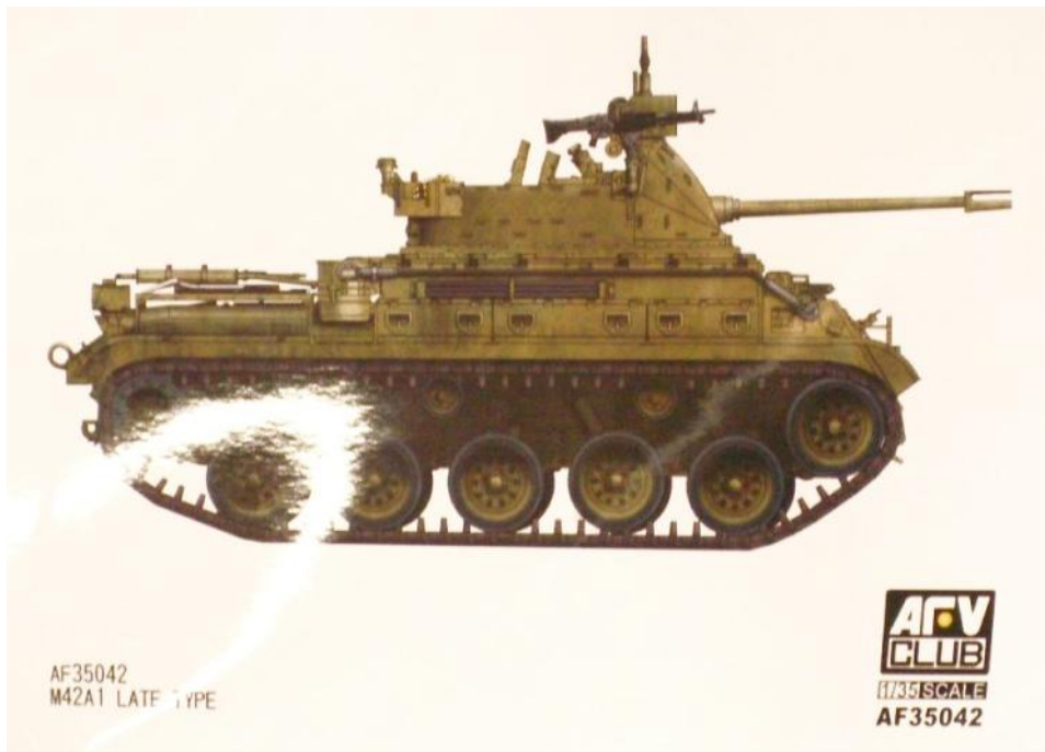
Picture 2: AFV Club M42A1 Late Type Duster that will be released soon.