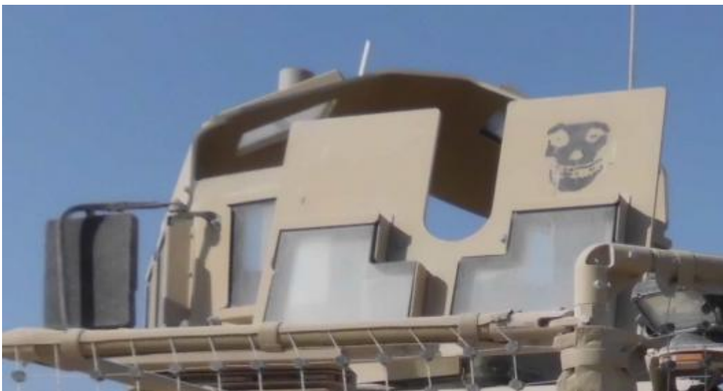
Here is a unit marking on the MRAP gun shield. It is a Skull Face. Photo taken January 8, 2012 by Michael Burns.

This vehicle also has a unique anti-RPG cage on it. It differs quite a bit from the slat armor you see on the Strykers or Leopard A2A6's you see in country. It reminds me of the “Bed Springs” attached to Russian T-34/85's late in the war to help prevent penetrations from Panzerfaust or