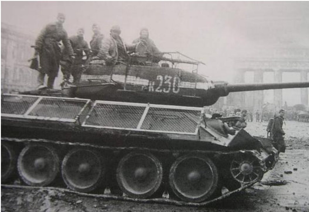
Here is a photo of a Russian T-34/85 with “Bed Spring” armor welded onto it to help protect it against Panzerfaust or Panzerschreck attacks. Photo taken in Berlin, May 1945.