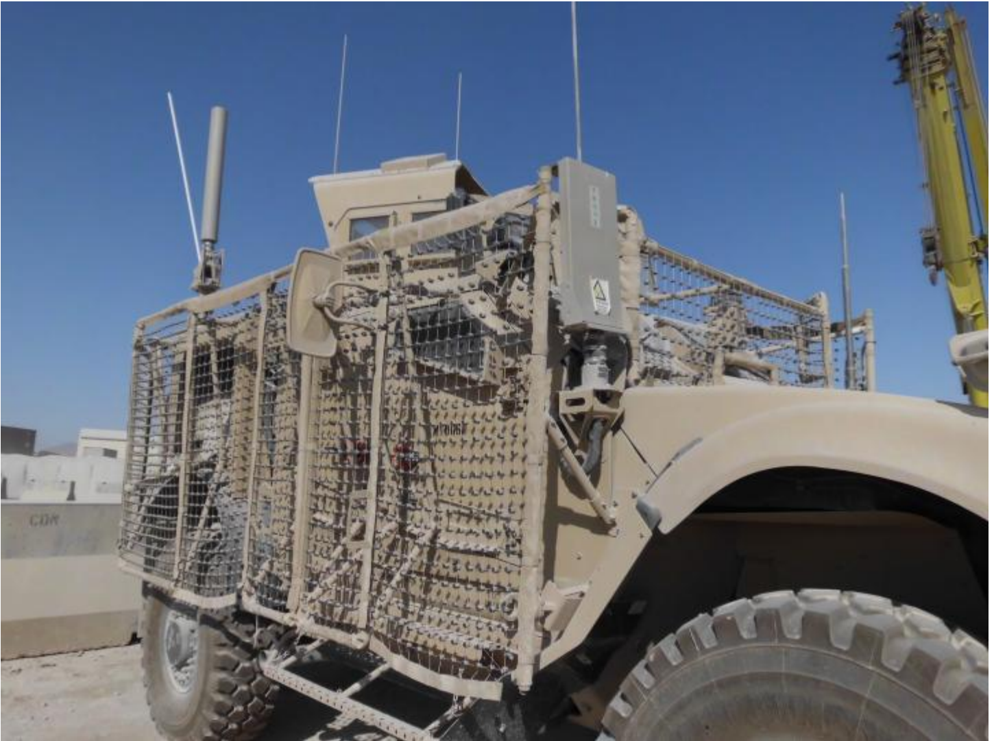
Editor: A few more shots showing the cage armor. Photo taken January 8, 2012 by Michael Burns.