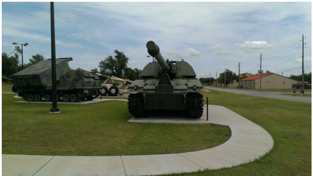
A front view of the XM2001 Crusader Self-propelled Howitzer. Next to it is the MLRS.

In May 2002, the Crusader program was officially terminated by the Department of Defense because it was not considered sufficiently mobile or precise for the evolving security needs of the 21 st century. This is a shame. It is an impressive weapons system.