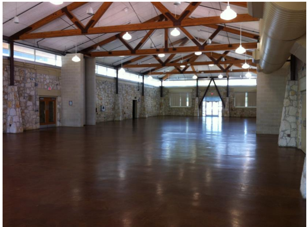
Picture 1: Main Hall. Plenty of room for vendor tables and display tables for the models.

“THE BUILDING IS VERY NEW AND WELL LAID OUT, AND THE GROUNDS ARE VERY NICE. PARKING SHOULD NOT BE AN ISSUE.”