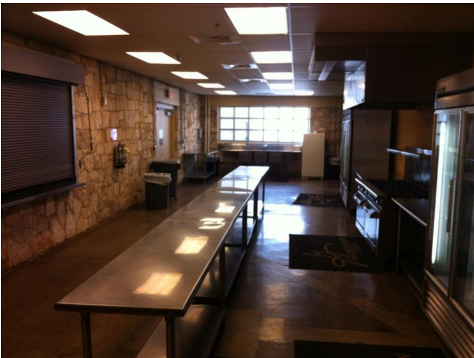
Picture 3: Kitchen - A.K.A. Judging room.