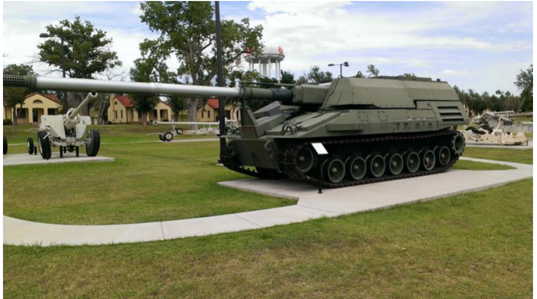
The Crusader is a huge and impressive vehicle. Photograph by Roderick Bell .

"IN MAY 2002, THE CRUSADER PROGRAM WAS OFFICIALLY TERMINATED BY THE DEPARTMENT OF DEFENSE BECAUSE IT WAS NOT CONSIDERED SUFFICIENTLY MOBILE OR PRECISE FOR THE EVOLVING SECURITY NEEDS OF THE 21 ST CENTURY."