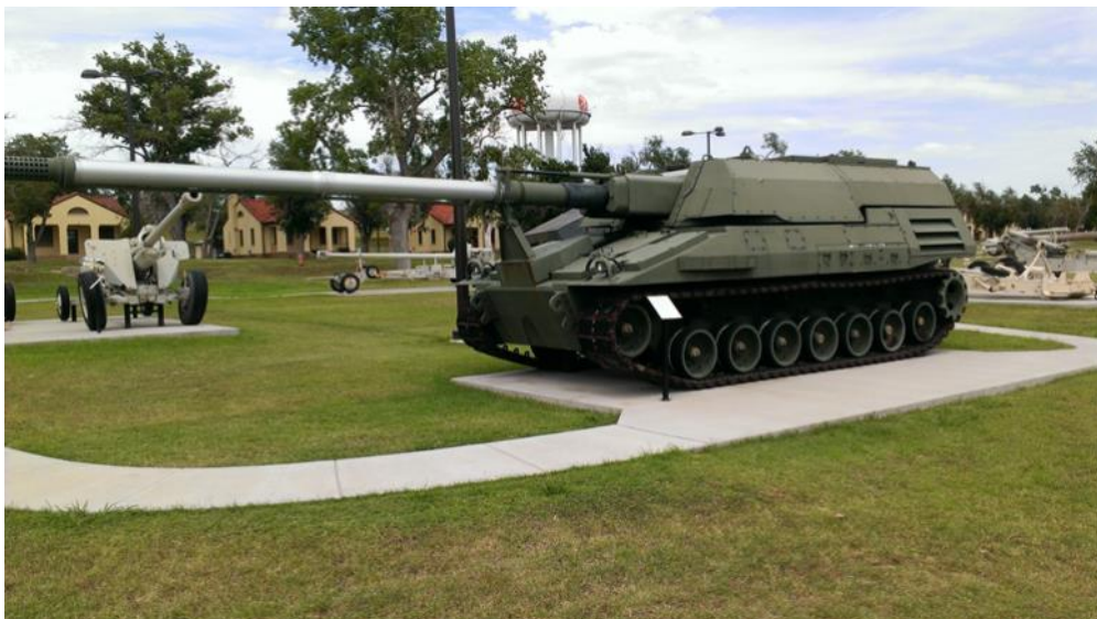
XM2001 Crusader.

Photographs of the XM2001 Crusader follow: