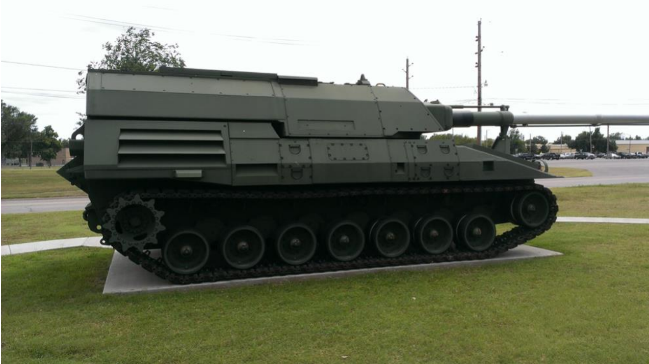
A couple of more views of the XM2001 Crusader Self-propelled Howitzer. Photograph by Roderick Bell .