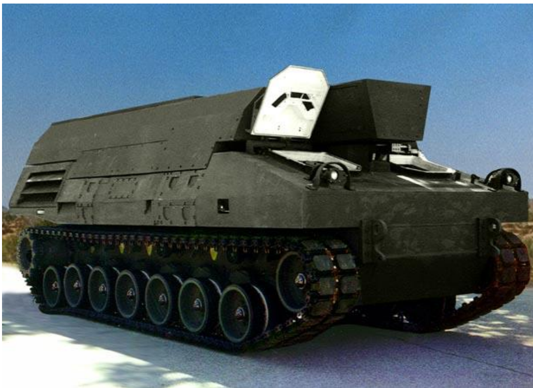
XM2002 Crusader Ammunition Resupply Vehicle.

XM2001 Crusader. The XM2002 was equipped with a fully automated ammunition handling subsystem. This allowed its three-man resupply crew to automatically transfer, under armor, up to 48 rounds of ammunition and fuel to the howitzer in less than 12 minutes. Resupply can be carried out in a contaminated environment. The resupply vehicle itself can be fully loaded with fuel and 110 rounds of ammunition in less than 60 minutes.