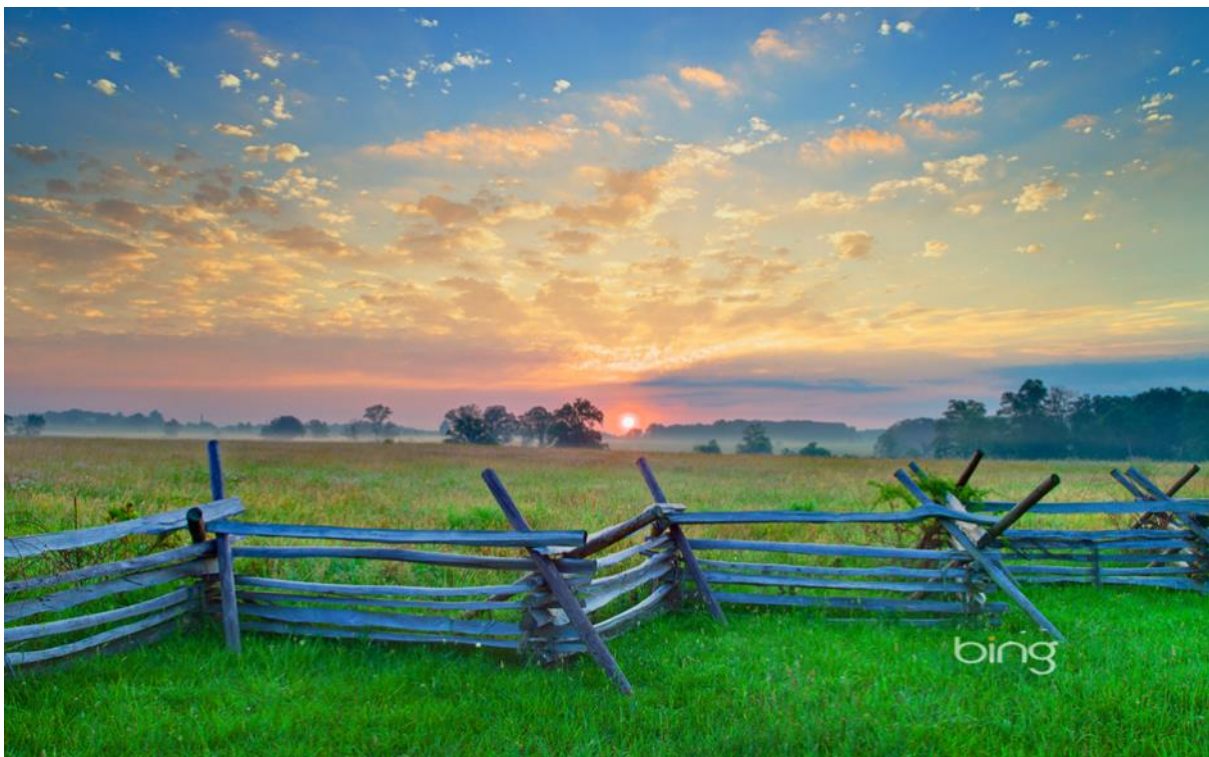
Gettysburg Battlefield where CSA General Pickett's Charge took place 150 years ago today. The Union was saved.