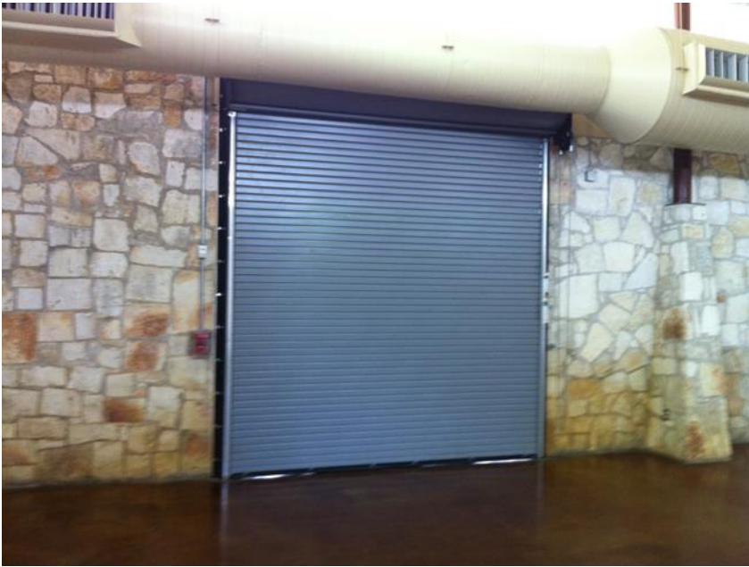
Picture 2: Vendor Loading dock. Vendors will be able to bring their wares into the venue via this loading dock.