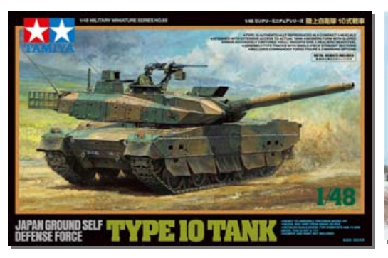
Due any day now is Tamiya's new 1/48<sup>th</sup> JGSDF Type 10 MBT.