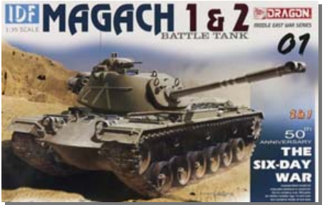
DML sure makes things easy for IDF modelers with their latest 1/35<sup>th</sup> 2-in-1 Magach MBT kit.