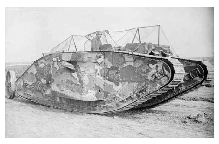
The first official photo of a tank entering combat on September 15<sup>th</sup>, 1916.