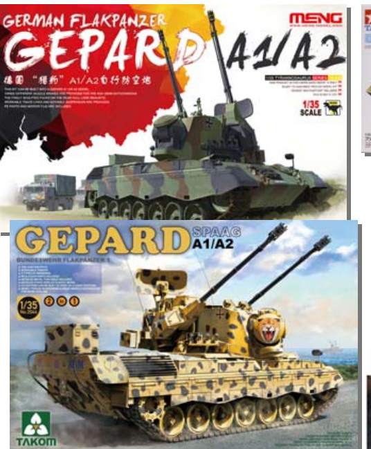
Lots of head-to-head releases lately. Here are Meng and Takom's 1/35<sup>th</sup> German Flakpanzer Gepard.