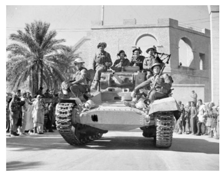
A Gordon Highlanders piper plays on a Valentine as it drives into Tripoli, January 26, 1943.

Montgomery had built up a huge advantage in numbers of everything needed to fight and, with the German's poorly supplied and not well supported, the British effort had little to overcome and frequently turned into a pursuit more than a battle.