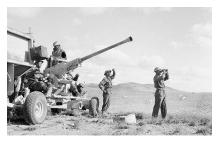
The crew of a 40mm Bofors gun watch the sky after a Stuka attack during the British advance on Tripoli, January 29, 1943.

Searching for inspiration for you all to spend the new year's modeling time, I looked at the Western Desert of North Africa seventy-five years ago, a time period and locale that I rarely consider. The British launch a new effort to take Tripoli in January 1943.