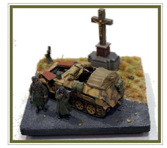
3rd Place: Greg Beckman 1/35th Sd.Kfz 250/1 Vignette