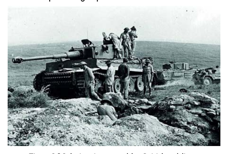
Tiger 131 being inspected by British soldiers.

The first intact Tiger I was captured by the British in fighting that occurred just before the attack on Longstop Hill. Although Tiger 131 was returned to England for study and later became a museum display, there is more recent photo analysis that suggests Tiger 131 was not the first Tiger captured in the lead up to Longstop Hill.