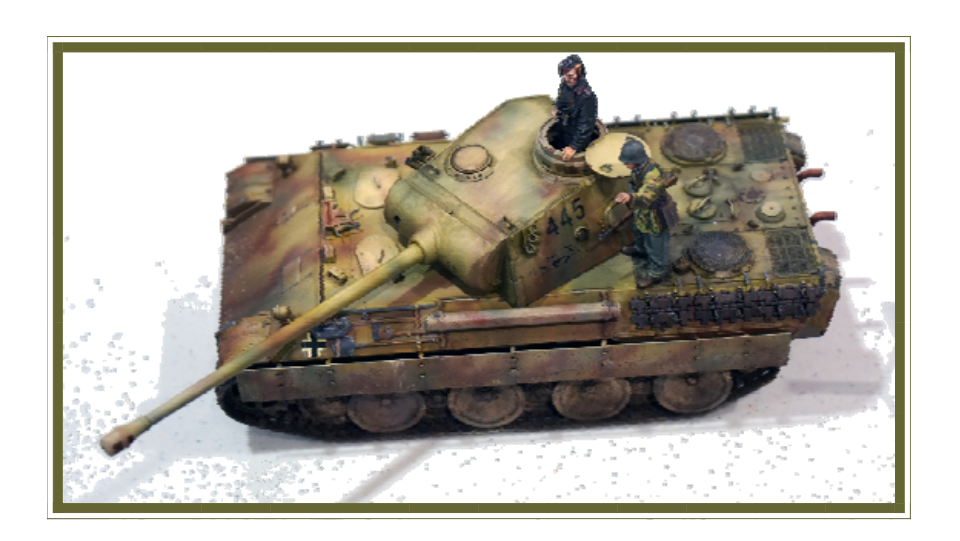
1st Place: lan Candler 1/35<sup>th</sup> Panther D