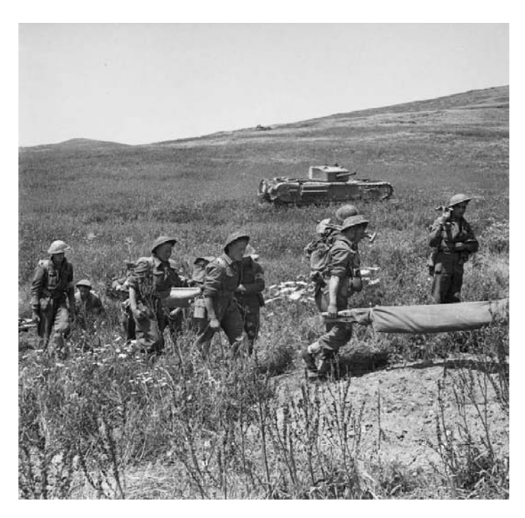
British soldiers at Longstop Hill with a Churchill from the North Irish Horse in the background.

This month's inspirational history is taking us to 75 years ago, in April 1943, during the Battle of Longstop Hill in North Africa. The was actually the Second Battle of Longstop Hill between the British and the Germans, taking place in the same location in Tunisia as a battle the previous December. There are a couple of interesting armor events that took place in this fight.